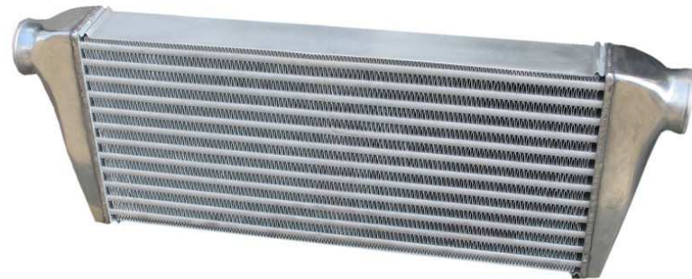
PARALLEL FLOW CONDENSERS, AIR COOLERS