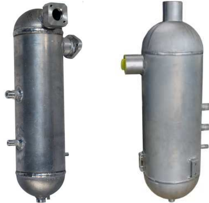
REFRIGERANT AIR DRYERS COOLER