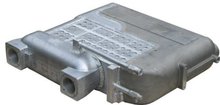
REFRIGERANT AIR DRYERS COOLER