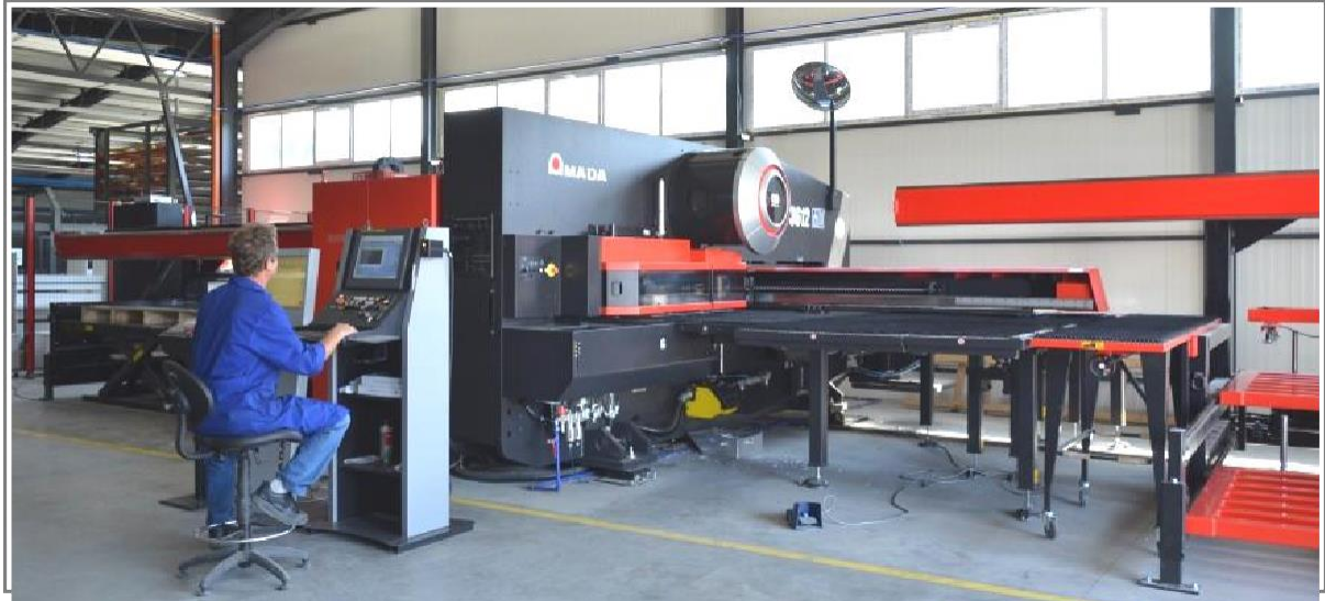
Revolver System: the revolver tool holder system “turret-shaped tool holder” allows up to 44 tools.

We cut, by punching, steel and aluminium plates, on MACHINERY TYPE PUNCH PRESS CNC Amada EMZ 3612 MII with automate charging and discharging, software PUNCH 5 ( LINE 5 16.0) .